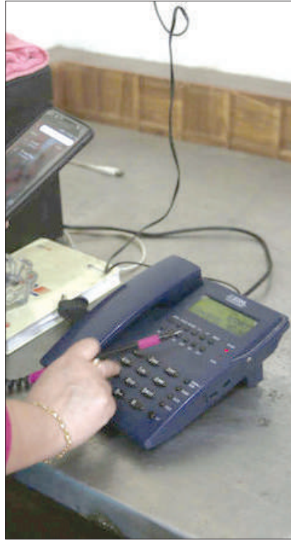
However, concerns are being raised over potential drawbacks of this technological

Businesses and establishments that were once reliant on landlines for day-to-day operations are making the transition to mobile and internet-based communication platforms. While indicative of progress, this shift poses challenges for those who may not have easy access to or familiarity with newer technologies.