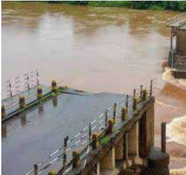
Faisal Akhooon | Srinagar

While people had to wait a decade before stepping on the incomplete Lal chowk-Rambagh flyover. Panderthan-Soiteng bridge, another such project awaits completion after eight years of incessant construction.